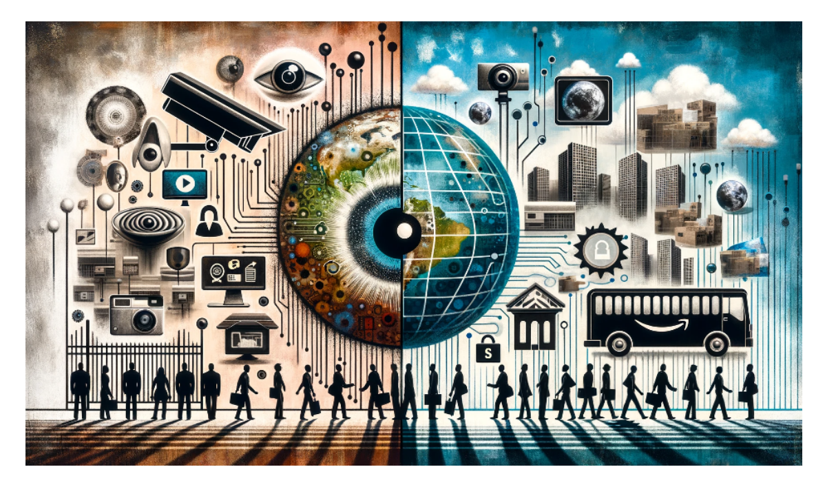
Generated by DALL-E

Al/ML is integrated into many aspects of our lives, from determining the next video in your YouTube or TikTok feed to deciding who receives favorable loan terms or an early parole. However, these systems are not created in a vacuum. Al/ML models are built using extensive data, which reflects the world's flaws and injustices. Moreover, the people who shape these technologies have their own priorities, preferences, and prejudices, which can lead to intentional or unintentional harm through discrimination, racism, classism, ableism, ageism, colorism, and more.